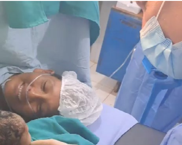
A young mother's first look at her newborn baby following her cesarean. In the past, she would have to wait for a seaplane to fly to the capital for surgery.

“The doctor’s presence gives them hope and reassurance that there are people who do want to help them and do not abandon them as they feel abandoned in these places as far away as the Amazon jungle. Each one who supports a medical missionary saves thousands of lives each year in far away and abandoned territories.”