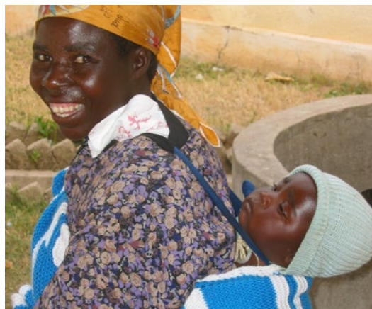
Healthy Mom and Baby leaving St. Therese Hospital in rural Zimbabwe, East Africa

Your continuing support of Mission Doctors is vital to continue to follow Christ's call to 'Heal the Sick'.