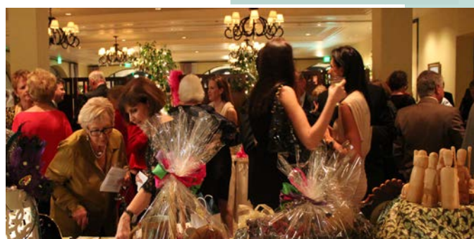
Attendees enjoying the cocktail hour and silent auction