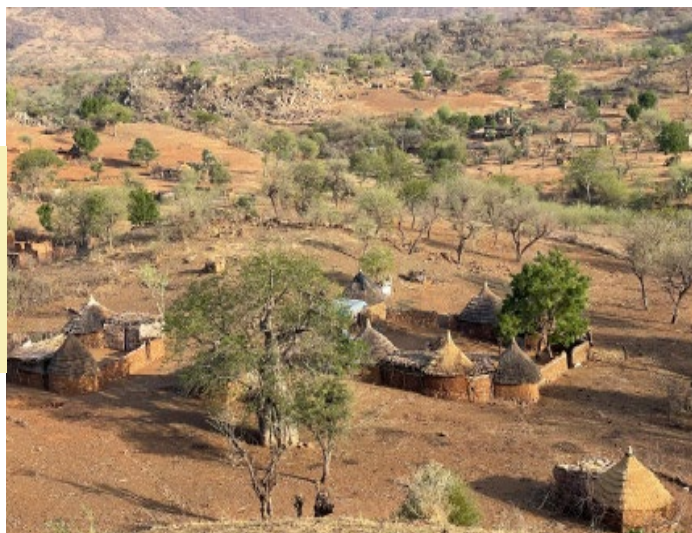
Simple homes in the Nuba Mountains. The people in this region rely on the healthcare provided at Mother of Mercy Hospital.

And to all of YOU, who give whatever you can, your partnership in sending Mission Doctors truly is a tangible way to share the love of God with our brothers and sisters around the world! Thank you!