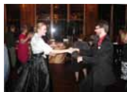
Friends of MDA, Midwest Winter Ball