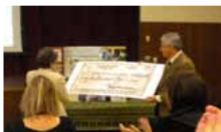
Auxiliary Presents a 'Big Check' to MDA