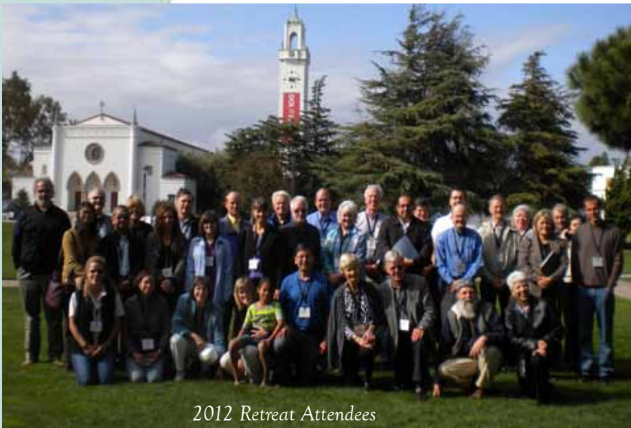
2012 Retreat Attendees