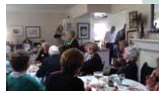
Friends of MDA, Santa Barbara Afternoon Tea