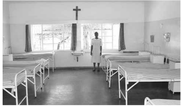
Empty beds are a sign of hope at St. Theresa's Hospital

two months for the medicines, and are very faithful about coming for their appointments and taking their pills.