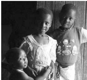
Children cared for by their grandmother

"I am certain it is because of the good AIDS treatment program that we have running. The people no longer are coming back and coming back, ill with one opportunistic infection after another, until they finally die of AIDS. We have about 1,400 patients who are returning every one to