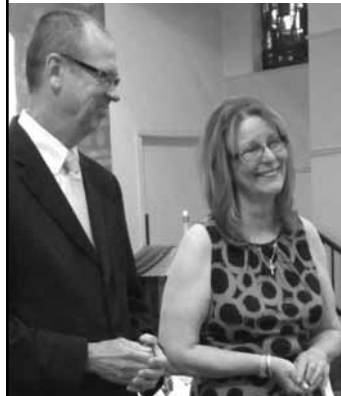
Hakes at Commissioning Mass in May 2010