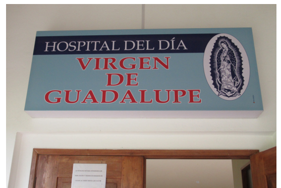
New sign at Hospital del Dia Virgen de Guadalupe