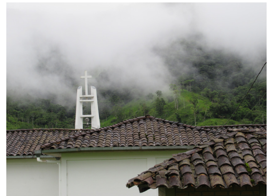
View of Parish Church at Guadalupe in the beautiful Ecuadorian Andes