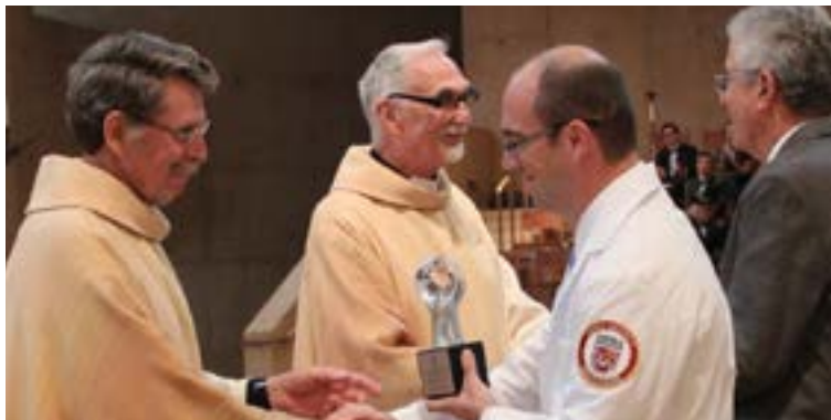
Presentation of the 2015 Catholic Doctor of the Year Award

As part of the community of Mission Doctors, you stand with us as we recognize the outstanding qualities of a Catholic Doctor, a doctor whose faith is woven seamlessly into their healing profession. Thank you for being our partner in this mission of healing and hope.