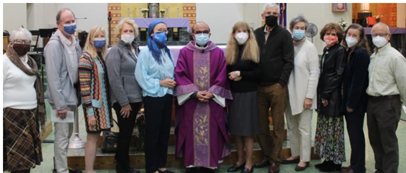
Newly Commissioned Mission Doctors with Mission Doctors Board Members, Auxiliary, Veteran Mission Doctors and Executive Director